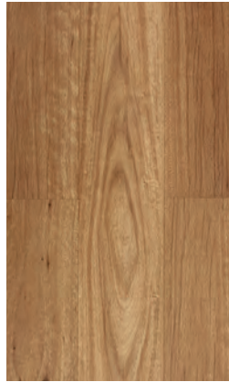
New England Blackbutt