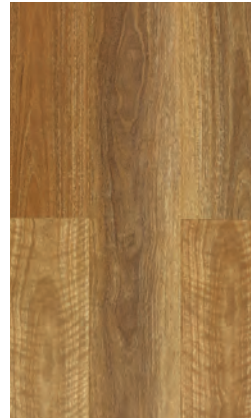
NSW Spotted Gum